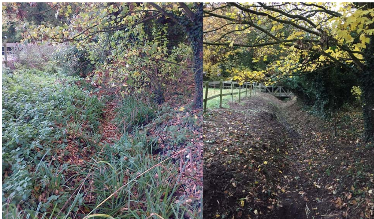
Memorial Hall bridge – before and after