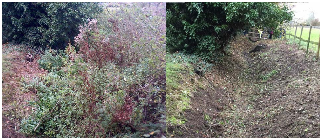
Footpath bridge – before and after